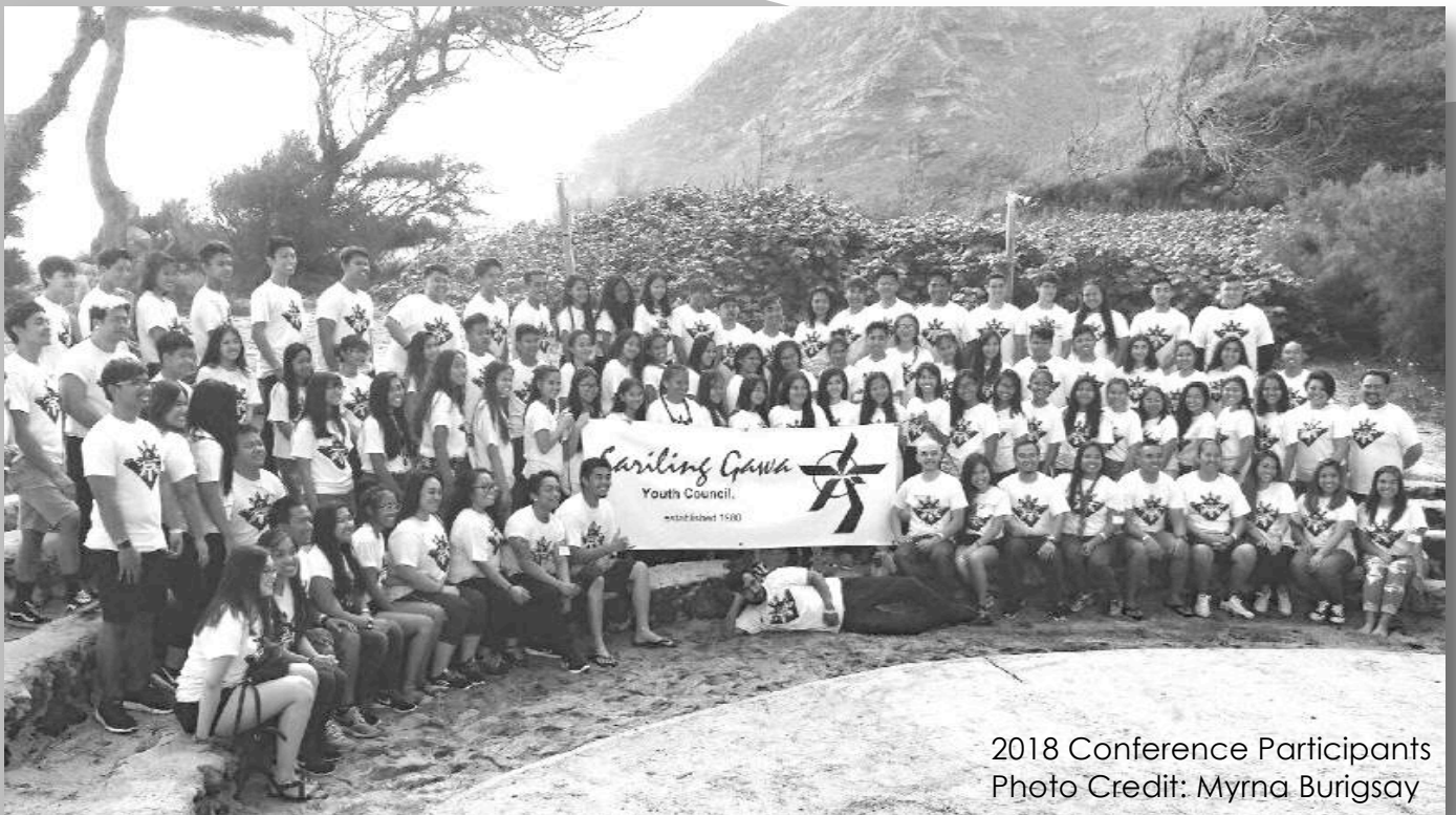
2018 Conference Participants

SARILING GAWA YOUTH CONFERENCE YMCA CAMP ERDMAN MOKULEIA OAHU MARCH 23-25, 2018