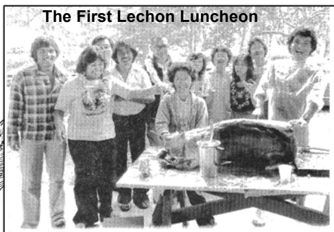
The First Lechon Luncheon