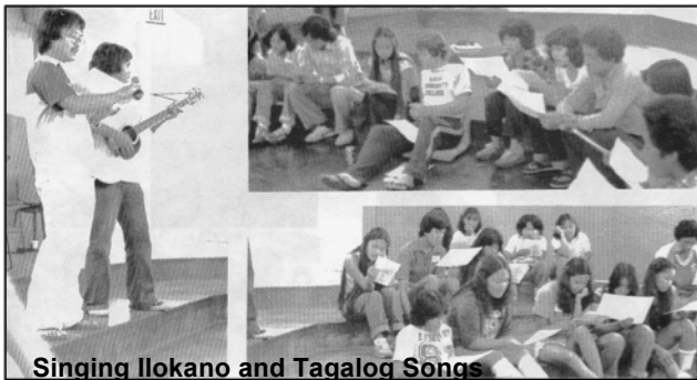
Singing Ilokano and Tagalog Songs