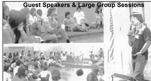
Guest Speakers & Large Group Sessions