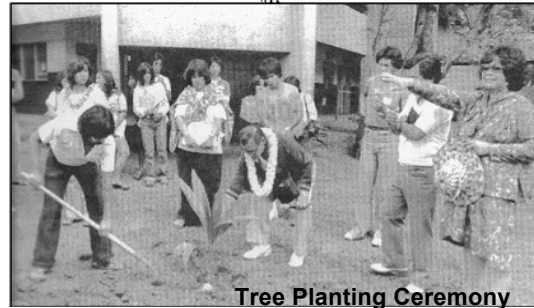
Tree Planting Ceremony